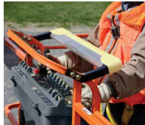
Previous platform style