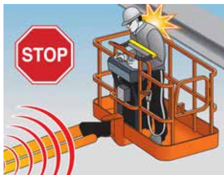
Horn sounds upon operator contact with the bar