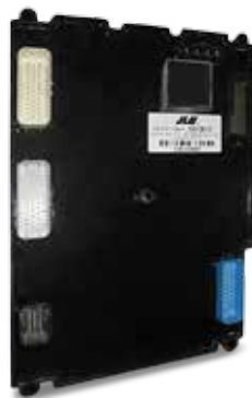
Non-UGM Ground Control Module