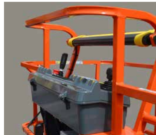
Latest platform style

IMPORTANT: Refer to following page for detailed application information.