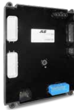
UGM Ground Control Module