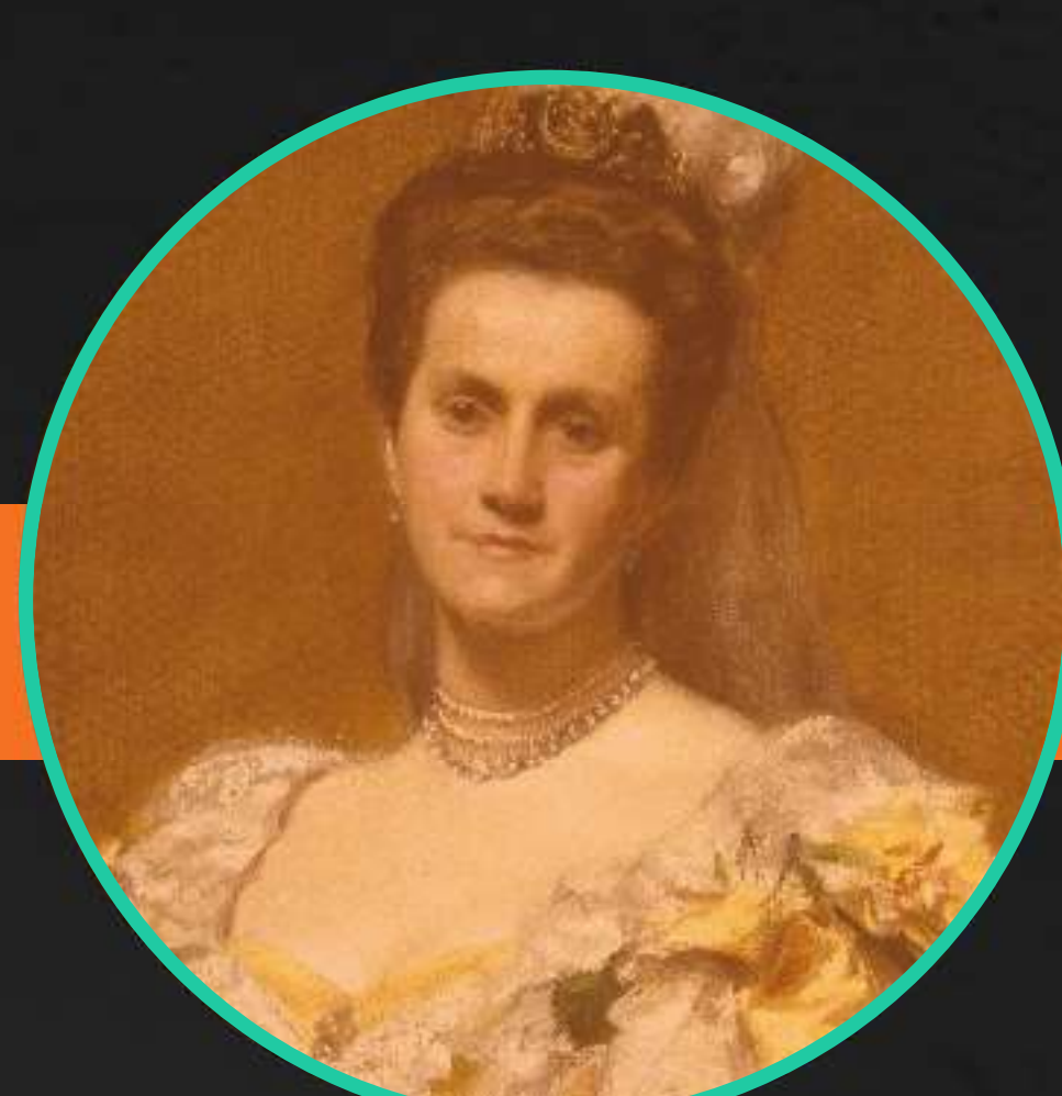
EMILY ROEBLING Stand-In Chief Engineer

Emily stepped in when her husband, chief engineer for the Brooklyn Bridge, became ill and died. She saw the project through to completion.