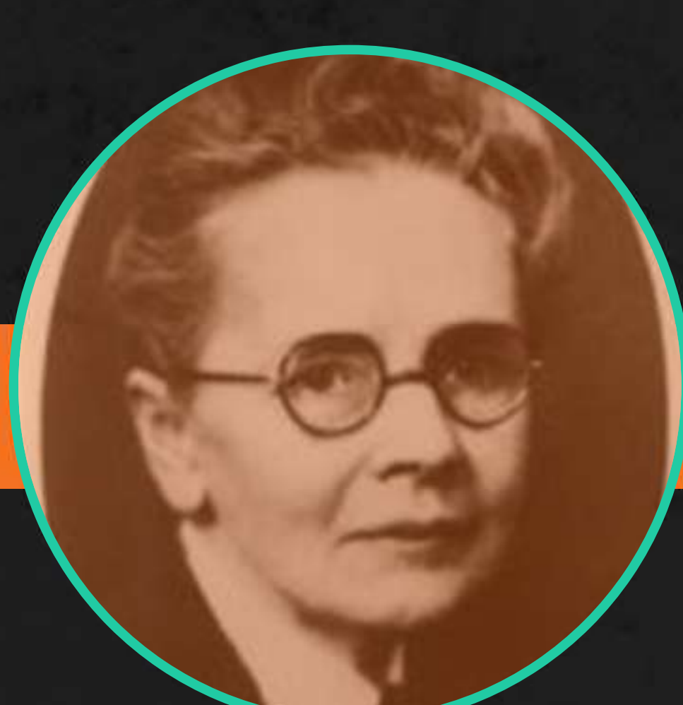
JULIA MORGAN First Female Architect Licensed by California

Emily stepped in when her husband, chief engineer for the Brooklyn Bridge, became ill and died. She saw the project through to completion.