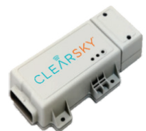
ClearSky Dual CAN