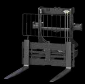
360-DEGREE ROTATING CARRIAGE