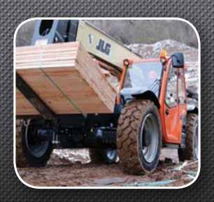
Ride Control Option Improves boom control over rough terrain.

Achieves a greater level of fuel efficiency with less environmental impact.