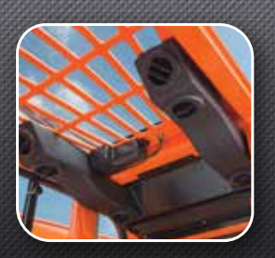
Optional Air Conditioning Stay cool on hot days and work in air conditioned comfort.