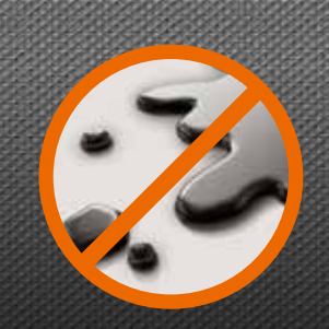
98% Cleaner Fewer hoses and couplings mean fewer potential leak points.