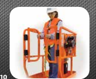
Saloon Gate Saloon-style swing gate for ease of entry and exit.