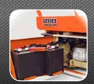
Serviceability All-steel swing-out battery doors have heavy-duty hinges.