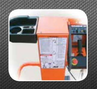
Tool Tray The workstation includes tool and fastener tray, 120/240V AC outlet and one-hand controller operation.