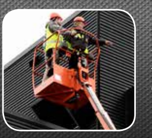
Platform Platform provides ample work space for 2 persons for both indoor and outdoor applications.