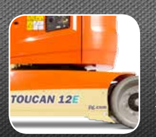
Enhanced Mobility Increased ground clearance gives the Toucan a 25% gradeability rating for enhanced mobility and transportability.