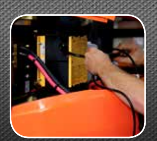
Maintenance Battery maintenance is made easy thanks to the centralised battery fill.