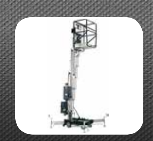
Durability Anodised mast is stronger, more rigid and maintenance-free for life.