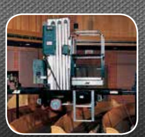
Reach More Places A Straddle Extension Kit available on all AM models.