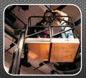
Quick Change Platforms Change your platform – without any tools – in less than a minute, to suit your specific application needs.