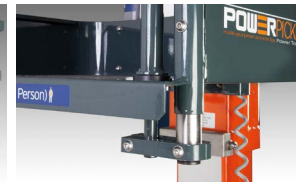
Automatic gate lock on elevation